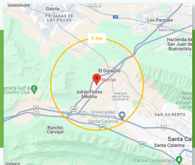
Figure 1: Area of Social Influence – Nematik Mexico García

The area of social influence for Nematik Mexico (García site) is defined as the area within 5 Km radius from the site: